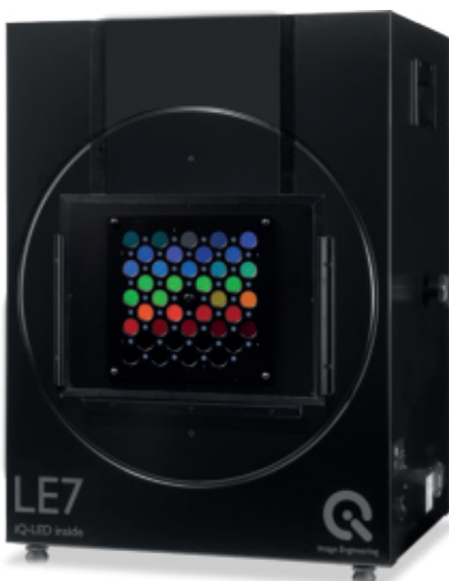
LE7 with the TE292 XL chart

The TE292* has been adapted from the front plate of the camSPECS device. This chart has been developed to be used primarily with the LE7 for camera calibration with iQ-LED illumination.